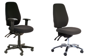
NYLON BASE With Arms